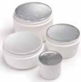
FOIL TRIMMING AND SEALING